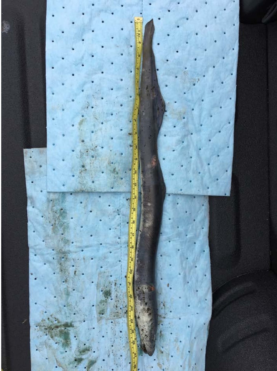
Figure 1. Lamprey mortality removed from the picket leads near the Washington shore count station.